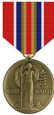
USMM World War II Victory Medal