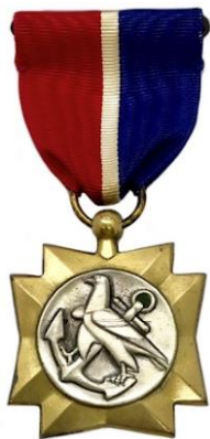
USMM Mariner's Medal

The USMM monument is located near the Lone Sailor monument and the Higgins Boat monument on Utah Beach. The photograph shows the concrete base with the bronze plaque mounted.