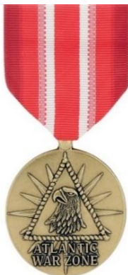
USMM Atlantic War Zone Service Medal